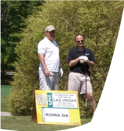
Golfers enjoy the day on the course at the Pine Oaks Golf Club at Robins AFB. Although no one sank the hole in one, everyone enjoyed the day.