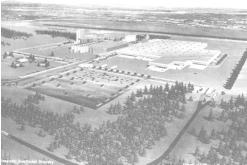
An artist's rendering of Miller Brewing Company's 10 million barrel brewery located in Albany, Georgia. Ground breaking for the brewery was initiated in 1978. The facility occupies 1.2 million square feet and cost $247 million to build. The site was the former Turner Air Force Base, located in the northeast quadrant of Albany.